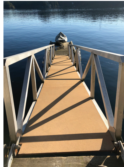
Installed September 2018